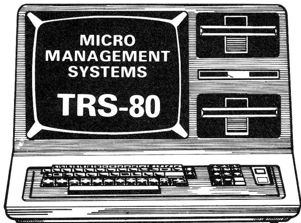
PURE RADIO SHACK EQUIPMENT

MODEL II 26-4002 64K I Drive..... $3098 Ask About Hard Drives